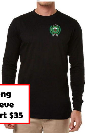
Long Sleeve T-Shirt $35

New range available at the general meeting!!