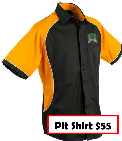
Pit Shirt $55