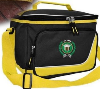
Cooler Bag $25