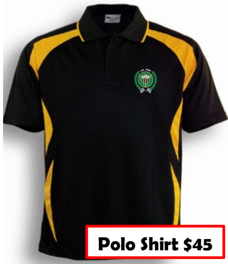
Polo Shirt $45