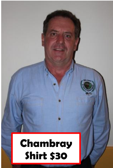
Chambray Shirt $30